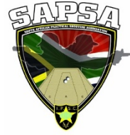
SAPSA IPSC & 3GN

FBSSC additionally recognises that many club members do not participate in any Shooting Sports, and that, in some cases, being a member of a Shooting Club is a 'requirement' to owning a firearm – regardless of it being used in sport, self-protection, hunting or business purposes. Additionally, the club recognises that firearm handling is a perishable skill. To this end, it has been cautiously agreed that the range facilities may be used for non-sport training in a limited manner; for the purpose of Self-Defence practise, Firearm Proficiency Training, and Firearm function/readiness assessment.