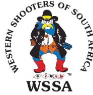
WSSA Cowboy Action