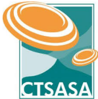
CTSASA Clay Target

The following Shooting Sports (available at FBSSC) have been approved by the Minister of Sport to recommence; however, only under strict guidelines that are outlined in this document.